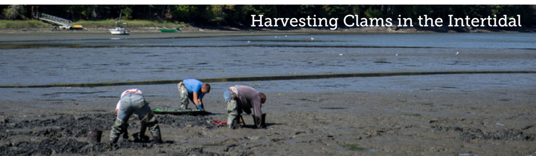
Harvesting Clams in the Intertidal

Fishing for menhaden, commonly referred to as pogies, begins in the spring and runs through the summer. These fish are caught using a purse seine that requires multiple boats working together to cinch the net and scoop up the fish into barrels. Pogies are primarily used as bait.